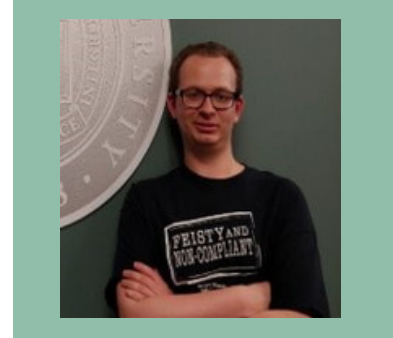
Community Transition Trainers

Hosted by the Michigan Developmental Disabilities Institute (MI-DDI)