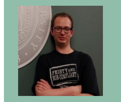
Community Transition Trainers