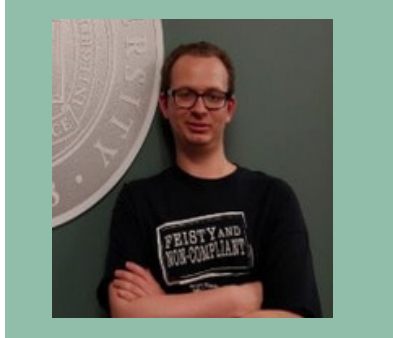
Community Transition Trainers

Hosted by the Michigan Developmental Disabilities Institute (MI-DDI)