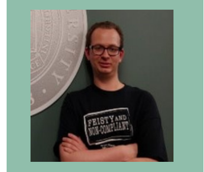
Community Transition Trainers

Hosted by the Michigan Developmental Disabilities Institute (MI-DDI)