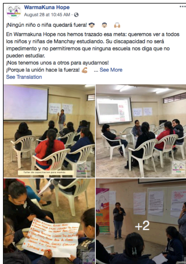
Figure 2: A Facebook post from Warmakuna Hope about inclusive education for parents of children with disabilities in Manchay.

was donated by Jill England, an expert on inclusive education, who is affiliated with MI-DDI.