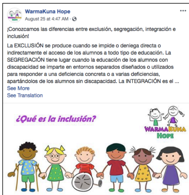
Figure 1: A Facebook post about inclusion from Warmakuna Hope.